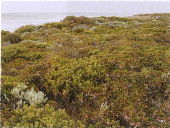
Plate 1 Vegetation type 1, 'Primary Sand Dune'.

Olearia axillaris , Spyridium globulosum , Agonis flexuosa Open Low Scrub over Scaevola crassifolia , Leucopogon parviflorus , Pimelea ferruginea , Acanthocarpus preissii Dense Low Heath over Lepidosperma gladiatum Very Open Tall Sedges over Poa poiformis Very Open Low Grass