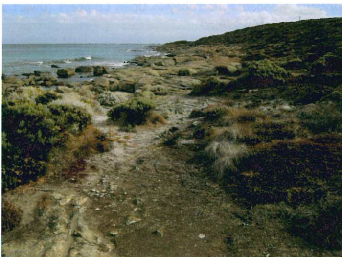
Plate 6 Vegetation type 4, 'Granitic / Sandy Foreshore'.

Olearia axillaris , Rhagodia baccata , Leucopogon parviflorus , Pimelea ferruginea , Dodonaea ceratocarpa , Leucophyta brownii Dwarf Scrub over Poa poiformis , * Romulea rosea var. rosea , Sporobolus virginicus Very Open Low Grass over Ficinia nodosa Very Open Low Sedges