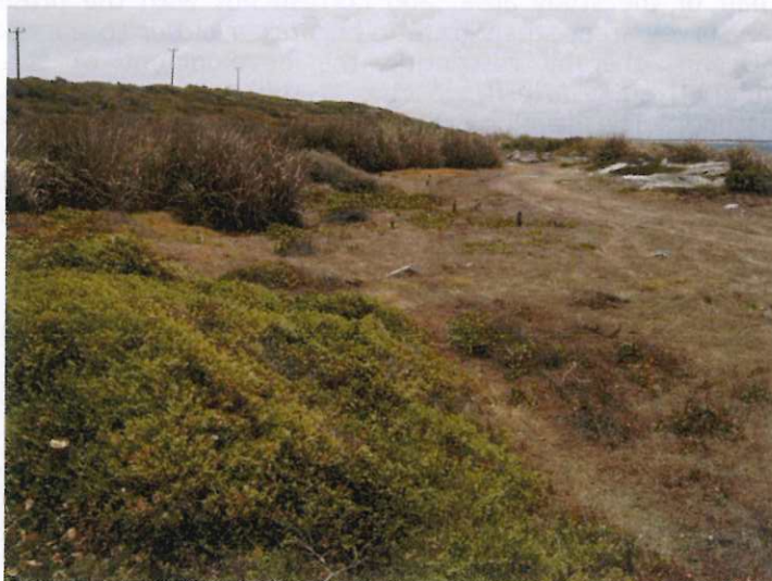
Plate 7 Vegetation type 5, 'Humic Granitic Platforms'.