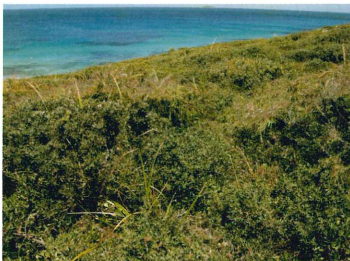
Plates 4 & 5 Vegetation type 3, 'Granitic Coastal Hill Slope'.

Agonis flexuosa , Spyridium globulosum , Hakea oleifolia Low Scrub over Scaevola crassifolia , Hakea oleifolia , Chorilaena quercifolia , Leucopogon parviflorus , + Bossiaea disticha , Pimelea ferruginea , Dodonaea ceratocarpa Heath over Lepidosperma gladiatum Very Open Tall Sedges over Desmocladius flexuosus , Lepidosperma squamatum Very Open Low Sedges