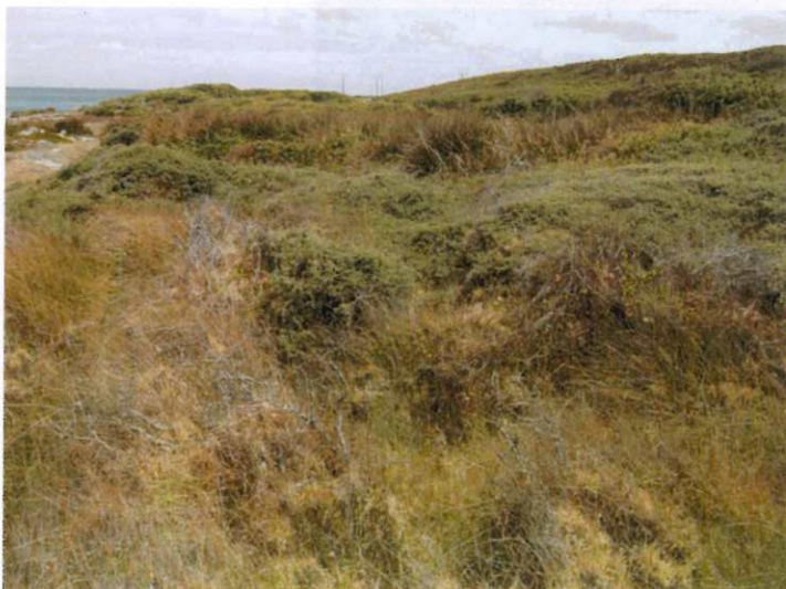
Plates 2 & 3 Vegetation type 2, 'Humic Granitic / Sandy Swale'.

Agonis flexuosa Open Scrub over Rhagodia baccata , Pteridium esculentum Dwarf Scrub over Muehlenbeckia adpressa , Kennedia macrophylla Open Climbers (Dwarf Scrub C) over Lepidosperma gladiatum Open Tall Sedges